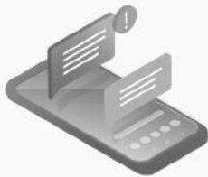
Messaging & notification facilities