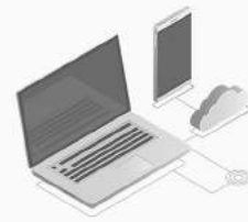
Real-time data syncing