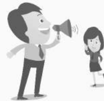
Improved communication between the salesperson & the customer